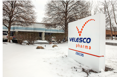
Velesco Pharma facility in Wixom, MI